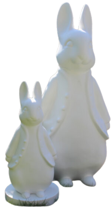
The blank sculptures before their transformation